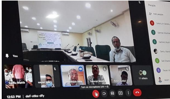
Online launching program of the project

various Fruit Plants (4800 numbers) like Mango, Guava, Ber, Sapota, Jackfruit and Amla at the cost of Rs. 128000.00, Forest Plants (6300 numbers) like Lambu, Sonajhuri, Kadam, Subabul, Neem, Gamar and Jam at the cost of Rs. 94,050.00, Vegetable Seeds (Spinash, Red Amaranthus, Cucurbits) at the cost of Rs. 7,500.00 and Vegetable Seedlings (Chilli, Brinjal, Tomato, Cauliflower) at the cost of Rs. 18000.00 were given to 300 farmers. An area of 4.8 ha was covered for developing homestead agroforestry under the project. Under model 1, 2.6 ha area and under model 2 with 2.2 ha area with a total of 4.8 ha area coverage were used for developing agroforestry. Approximately 80 farmers utilized homestead barren lands and/ or homestead backyard land covering 1.6 ha area.