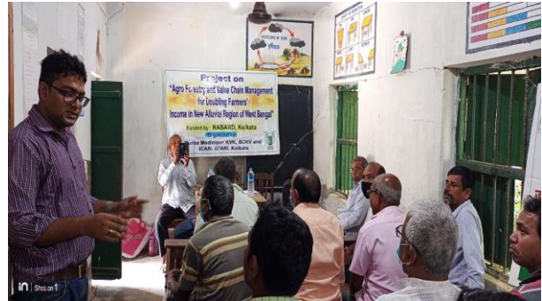
Training programme on vegetable crop managements