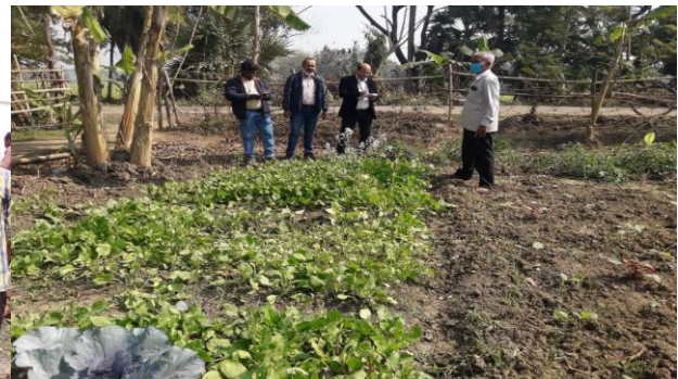
Field visit by DDM, NABARD, Purba Medinipur with KVK Scientists