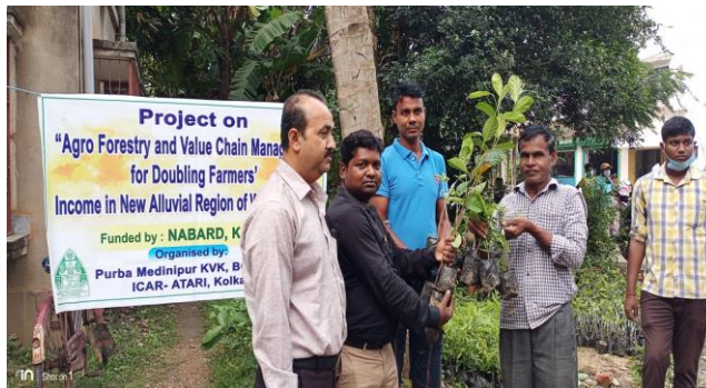
Planting materials and input distribution among the selected farmers